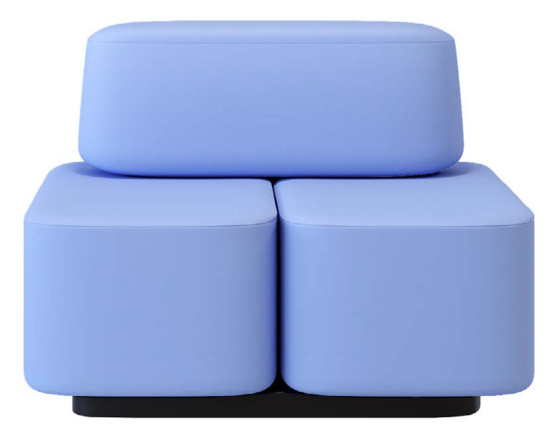
901 IRRESISTBLE | CLASSIC COLLECTION IR06 | Sky