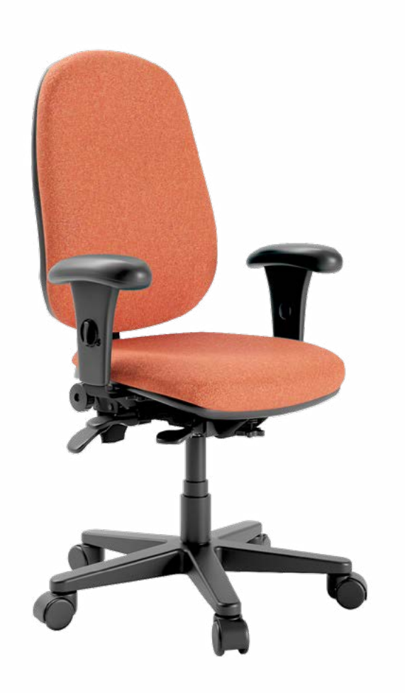
6800ti FELT MELANGE | SOLID COLLECTION FELT10 | Pollen

BEELINE | PVC FREE COLLECTION BEL10 | Myth