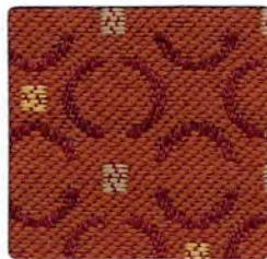
CONTEXT FALL SONG