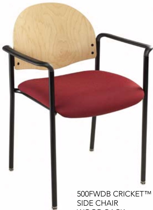
500FWDB CRICKET™ SIDE CHAIR WOOD BACK UPHOLSTERED SEAT