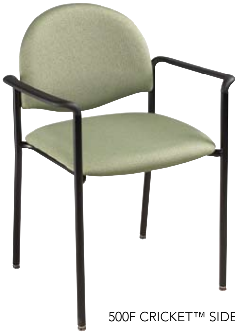
500F CRICKET™ SIDE CHAIR