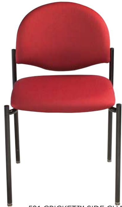
501 CRICKET™ SIDE CHAIR ARMLESS