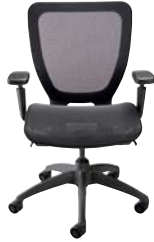
[ WXO 5800-M ]