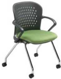
[ NXO 6401CH - CHROME OPTION ]