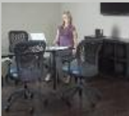
MXO Automatically Returns to Position