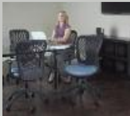
MXO Automatically Returns to Height