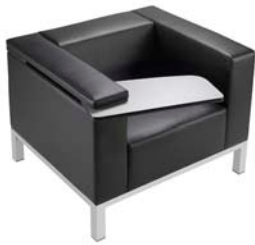
[ single 1301AT ]